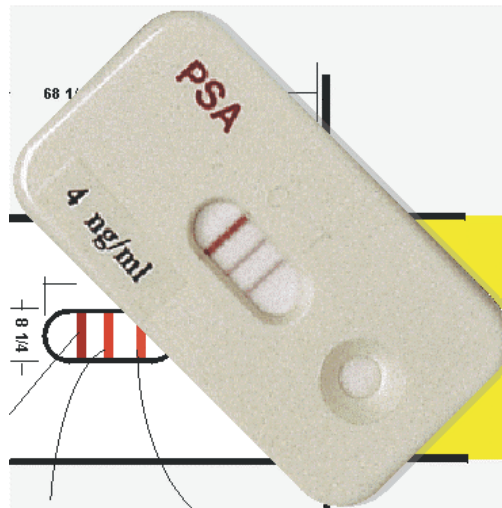
Figure 2. A Positive Reaction for PSA with the Seratec Kit

The Seratec PSA Semiquant Kit was developed as a screening test for the detection of human prostate cancer. Therefore it was designed as semiquantitative test. In this regard, it contains a 4ng PSA/mL internal standard (Figure 2). The company literature states that for the detection of seminal fluid, this test is used as a qualitative test and the internal standard is insignificant. However, in this analysts study, this internal standard can be quite helpful in estimating the concentration of PSA present in an unknown.